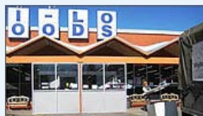
Recent changes in JP