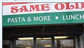
Pizzeria sees continued support