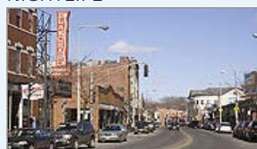
A night out in Jamaica Plain