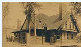
Inn, founded by brewers, quenched local thirst