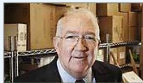
West Roxbury native is president of Catholic Relief Services