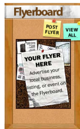
Local advertising by PaperG