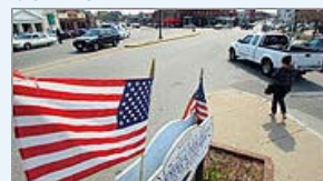
Arts community stir a happily gritty neighborhood