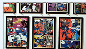
'Stolen' art comes to East Boston gallery