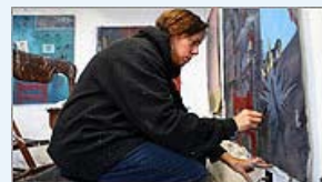
An out-of-the-way artist colony