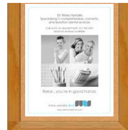
Local advertising by PaperG