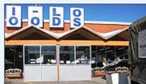
Recent changes in JP