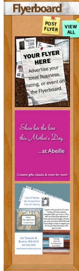
Local advertising by PaperG