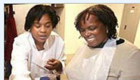
On the street where you live