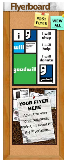
Local advertising by PaperG