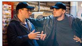
Southie through the movies