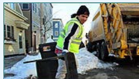
Talking trash over parking