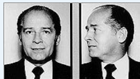
It's been 16 years, but the search continues