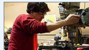
Bikes to your specifications