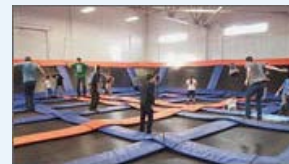
Trampoline park says have fun, keep it safe