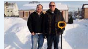
Months after blast leveled home, couple still picking up the pieces