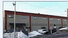
No leads in theft from police facility