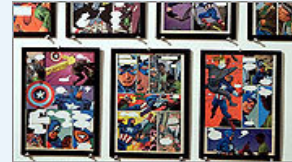
'Stolen' art comes to East Boston gallery