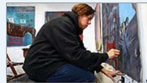
An out-of-the-way artist colony