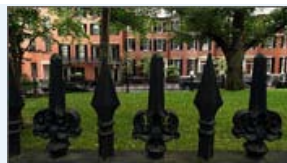
See iconic images from the neighborhood