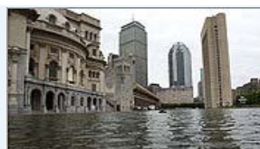
Past, future of Christian Science Plaza