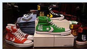
Changes on Newbury Street