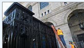
The remaking of a grand entrance