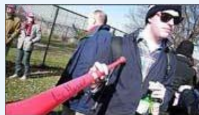
Tailgating at the Harvard-Yale game