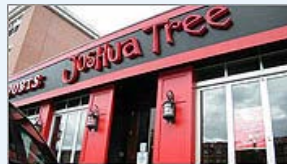
A turbulent year for Allston businesses