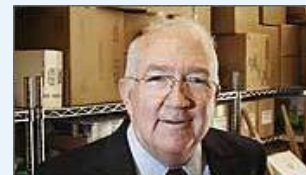
West Roxbury native is president of Catholic Relief Services