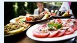
Find restaurants in West Roxbury