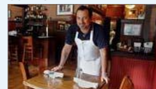
A cultural remix in West Roxbury