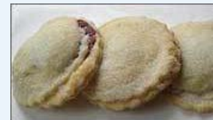
Cupcakes, cookies, and pastries at Sugar Bakery