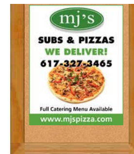
Local advertising by PaperG