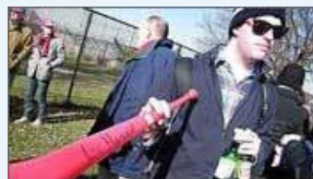
Tailgating at the Harvard-Yale game