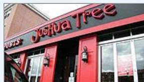
A turbulent year for Allston businesses