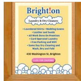
Local advertising by PaperG