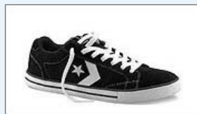
They kick it in Allston like no place else