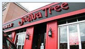
A turbulent year for Allston businesses