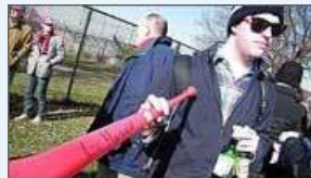
Tailgating at the Harvard-Yale game