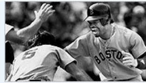
Vote for your favorite crunch-time performance