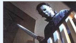
Our picks for the Top 50 scariest movies of all time