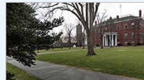
Local colleges and universities with a hefty price tag