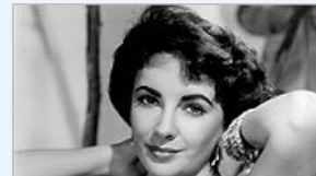
Remembering legendary actress Elizabeth Taylor