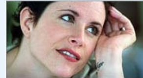
Remembering those who passed away this year