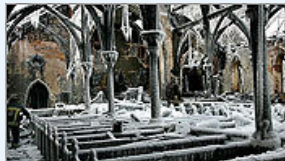
A church reborn