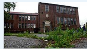
Community center begins to take shape