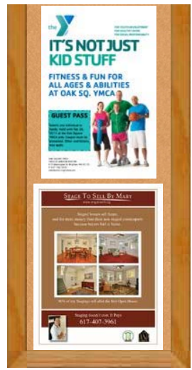
Local advertising by PaperG