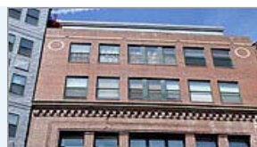
Residents face identity crisis