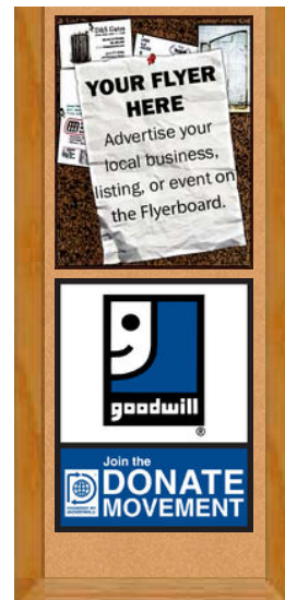
Local advertising by PaperG