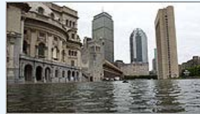
Past, future of Christian Science Plaza