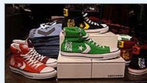
A good year for Newbury Street