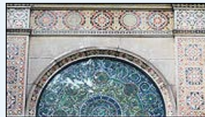
Tiffany mansion a Back Bay jewel