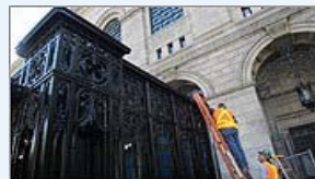
The remaking of a grand entrance