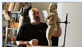
Sculpting a better life for others