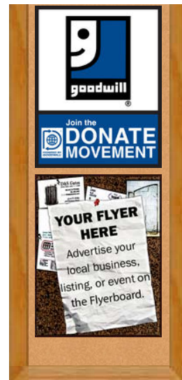
Local advertising by PaperG