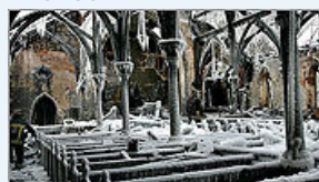
A church reborn