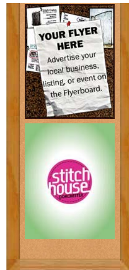
Local advertising by PaperG