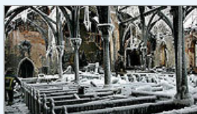
A church reborn