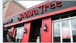
Allston bar serving 10-day liquor suspension