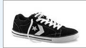
They kick it in Allston like no place else