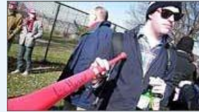
Tailgating at the Harvard-Yale game