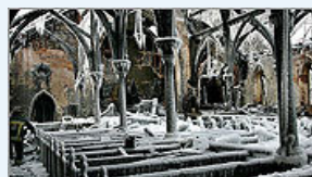
A church reborn