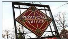
Main Street model revitalizes Roslindale