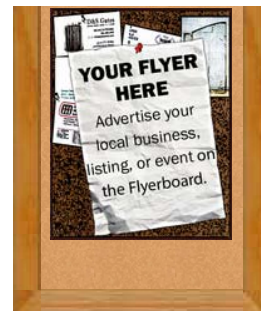
Local advertising by PaperG