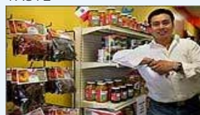
El Chavo carries diverse tastes of Mexico