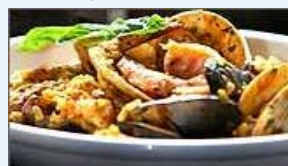
Find Roslindale restaurants