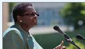
Ailing Roslindale block gets a new life