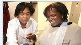
On the street where you live