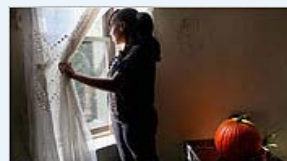
Fear revisits a Boston neighborhood