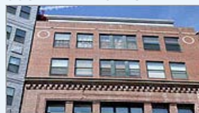
Residents face identity crisis