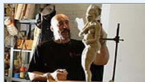
Sculpting a better life for others