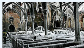
A church reborn