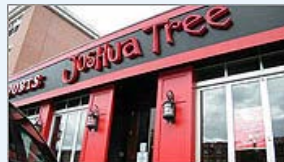
Allston bar serving 10-day liquor suspension