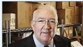
West Roxbury native is president of Catholic Relief Services