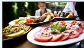
Find restaurants in West Roxbury