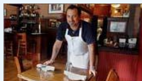
A cultural remix in West Roxbury