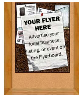
Local advertising by PaperG