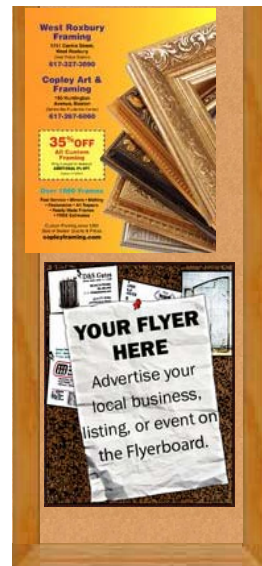
Local advertising by PaperG