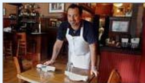
A cultural remix in West Roxbury