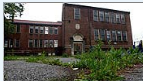
Community center begins to take shape