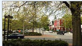
An ache at the core of the community