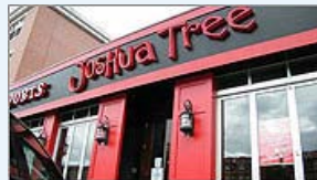
Allston bar serving 10-day liquor suspension