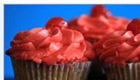
These cupcakes are the bomb

View reader comments ( ) » Comment on this story »