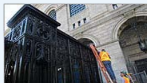
The remaking of a grand entrance