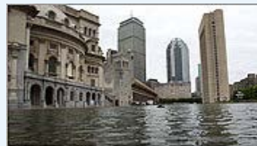
Past, future of Christian Science Plaza