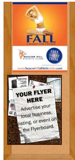
Local advertising by PaperG