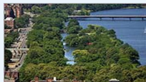
100 years of celebrating the Fourth of July