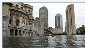
Past, future of Christian Science Plaza