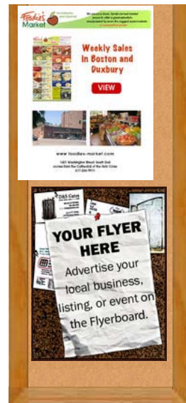
Local advertising by PaperG