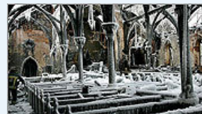
A church reborn