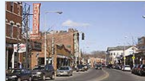
A night out in Jamaica Plain