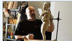
Sculpting a better life for others