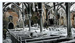
A church reborn