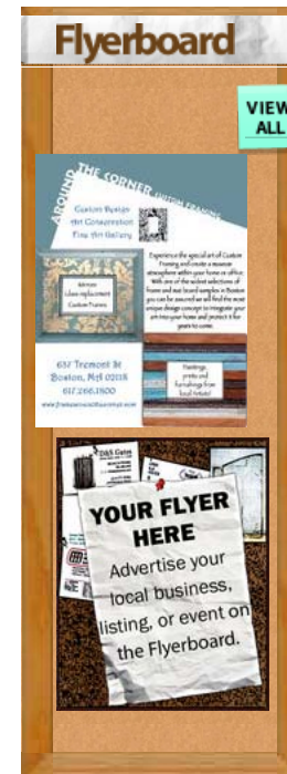
Local advertising by PaperG