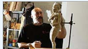
Sculpting a better life for others