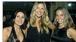
Photos from the BostonGives 2009 Big Give Event