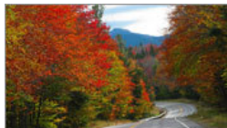
Go leaf-peeping in New Hampshire's White Mountains