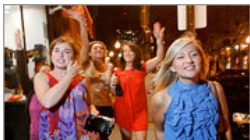
North End bar scene has some residents annoyed