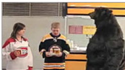
Hold your beverage and vote. The winning ad gets an award